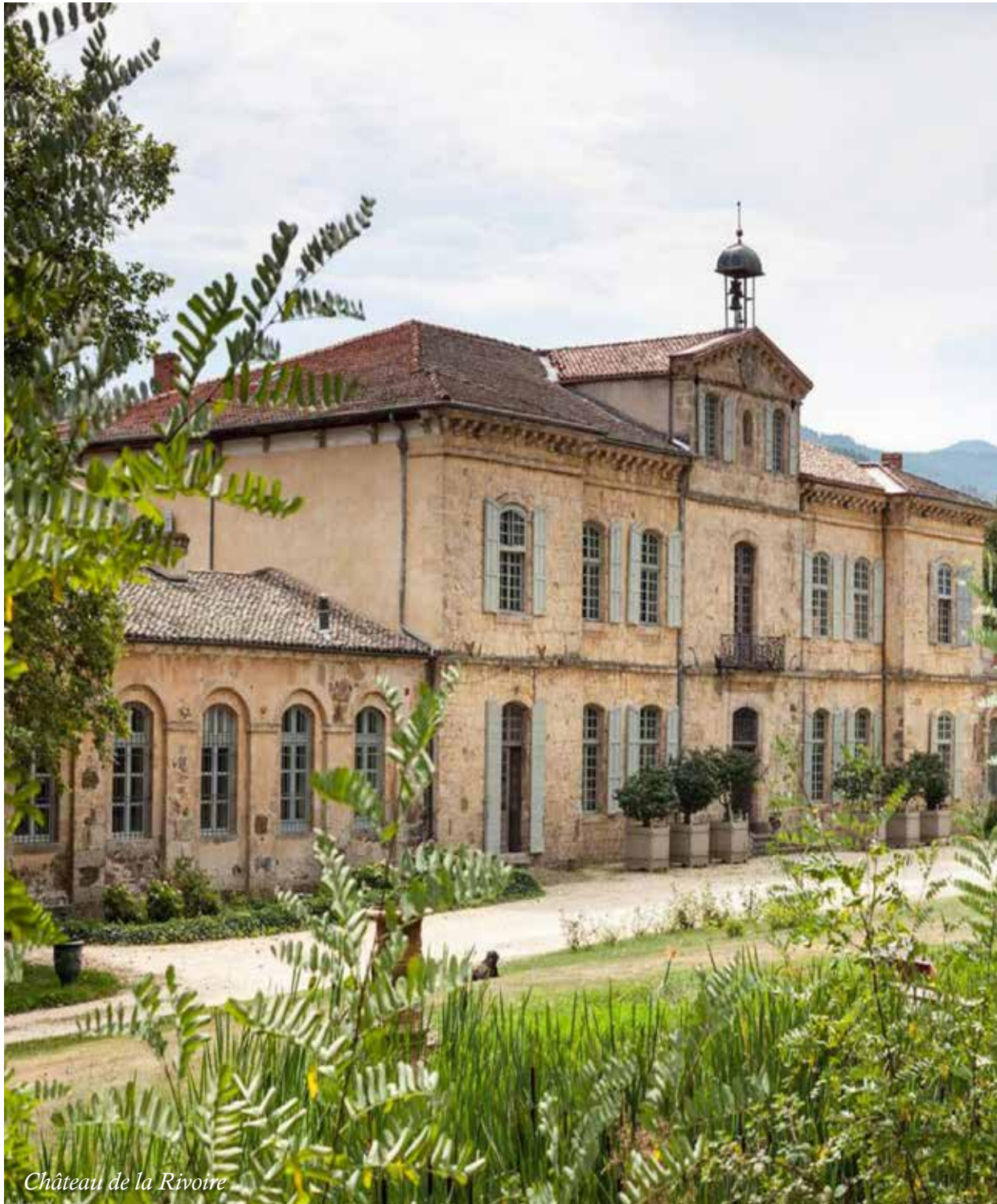
Château de la Rivoire

2020 Grants | Notre-Dame Cathedral Update | Education